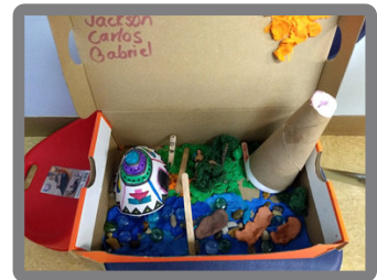
The Spanish track's group dioramas on Native American territories.