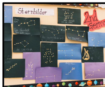
2G's illustrations of constellations in our solar system!