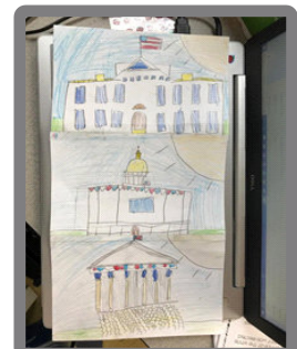
Illustrations of the United State's government buildings