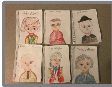
Portrait drawings of important historical figures

What was the geographic impact from breaking apart from Great Britain?