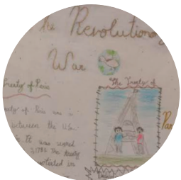
Students created posters in groups describing The Revolutionary War.

Students will be inquiring into the function of the government and how it operates. They will be discussing the rights of citizens and how the government was created to protect us.