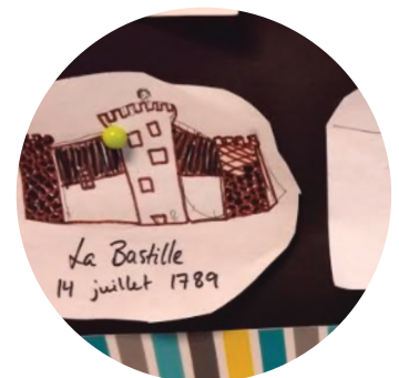
4F illustrated a timeline of the French Revolution.