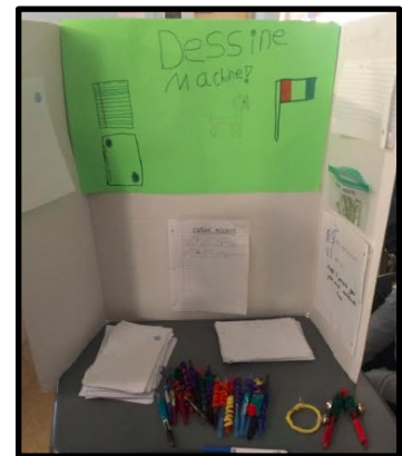
Various work from 3rd grade's Market Day!