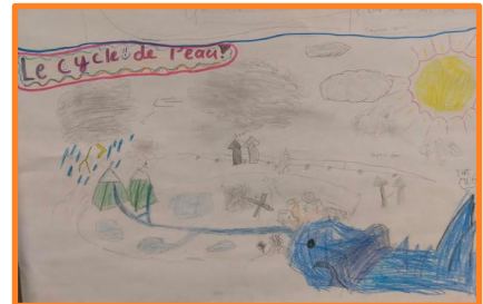
Students illustrated the water cycle!