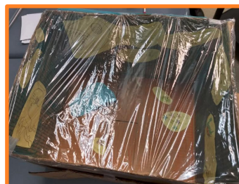
Students created models of ecosystems!