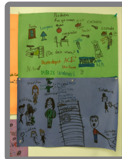
The Spanish track's posters demonstrating which professions and businesses provide products and/or services