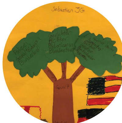
3G created collages describing each branch of the government.