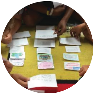
3S sorting the responsibilities of the branches of the government.

Students will be learning about erosion, fossils, and the properties of rocks. Throughout this unit there will be many hands-on learning opportunities for students to explore various types of rocks and different fossils.