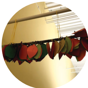
3rd grade mobiles of the three government branches!