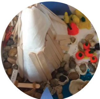
2nd grade created dioramas for their final projects!

Students will be inquiring into what a system is and how systems work. They will discuss various systems such as the government system and the solar system.