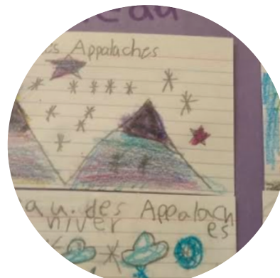
2F illustrated the Appalachain mountain !